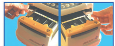
Urine sticks can be placed from both the left-handed and right-handed side.